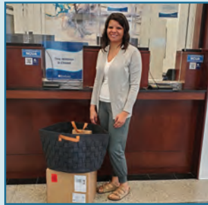
Angela C. via Social Media

To celebrate International Credit Union Day®, we hosted a prize drawing at all our branches and online for a bundle of family-focused gifts. Meet our lucky members!